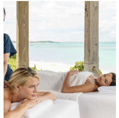
WELLNESS & SPA