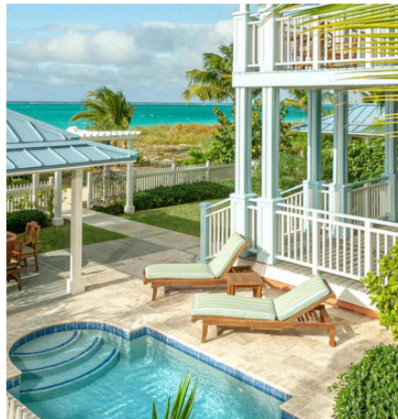
5 STAR ACCOMADATIONS