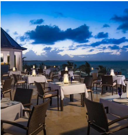
FINE & CASUAL DINING

Key West Village: The family villas and suites are located in this village.