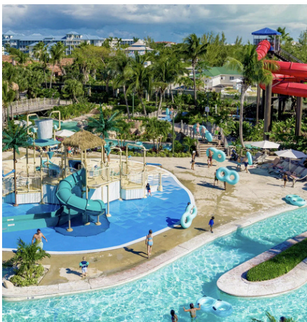
ACTIVITIES FOR ALL AGES